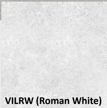
VILRW (Roman White)