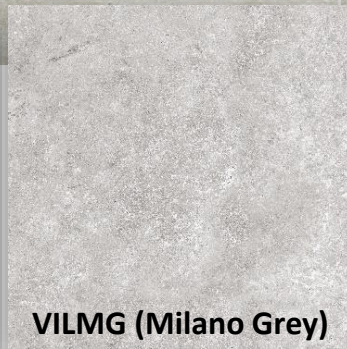
VILMG (Milano Grey)