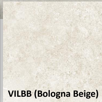
VILBB (Bologna Beige)