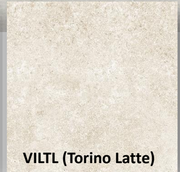
VILTL (Torino Latte)