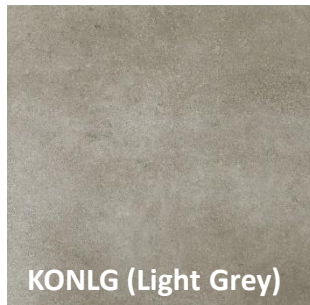
KONLG (Light Grey)