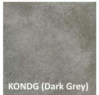
KONDG (Dark Grey)